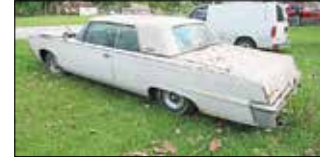
2000 Chevy Astro Work Van vin#1GCDM19W7YB212137

1965 Chrysler Imperial Crown Coupe vin#84048132029