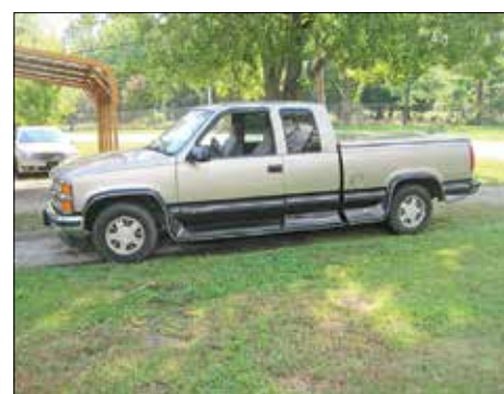
1998 Chevy Silverado w/Cover vin# 2GCE- C19R1W1108144

ANTIQUES/COLLECTIBLES: Rock-Ola 476 Juke Box; "Strong Women" by Norman McCrae; 33 rpm Albums; Childs Peddle International Tractor; Clown Figurine Collection; Coke Glasses; Glass Statues; Lighthouse; Misc. Sterling Pieces; Set of Coke Dishes.