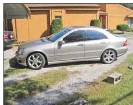
2007 Mercedes C230 4 dr, vin# WDBRF52H47A918195